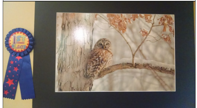
First Place Winner - Barred Owl on a Snowy Day by Tyler A. Reber

Please see Page 9 for a full list of photo contest winners, honorable mentions, and special categories.