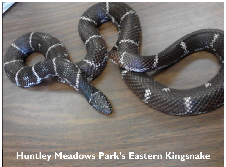
Huntley Meadows Park's Eastern Kingsnake

Eastern Kingsnakes have one of the largest geographic ranges of any North American snake species, are nonvenomous constrictors, thrive in many terrestrial habitats as well as in areas close to water. They eat a variety of prey, including lizards, rodents, birds, turtle eggs, and even other snakes. Eastern Kingsnakes are immune to the venom of other snakes in their range.